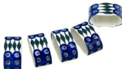
8-38 Napkin ring H=4cm, 7x3cm