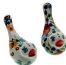
8-72 Salt shaker bird H=5cm, 8x5cm