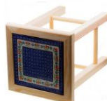
8-91 Stool with Tile H=47,5cm 35x33cm