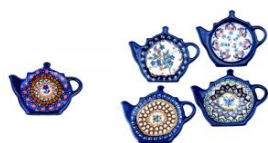
8-25 Teabag saucer mug cover 12.5x8.5cm