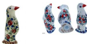
8-71 Salt Shaker Penguin H=12cm