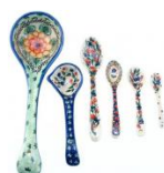
8-45 Ladle L=31cm