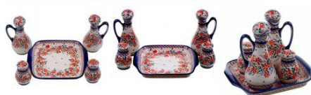
8-04 Oil and vinegar salt and pepper on tray H=16cm, 20x17cm