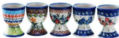
8-15 Egg cup H=6.5cm