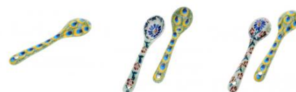
8-16 Sugar spoon L=14cm