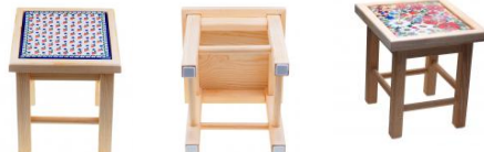
8-90 Stool with Tile H=33,5cm 32x30cm