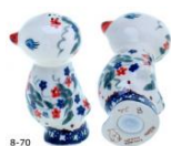
8-70 Salt shaker duck H=11.5cm