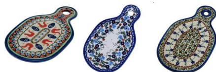
8-22 Cutting board H=1.5cm, 26x15cm