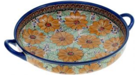
11-12 Large round baker H=5,5cm,